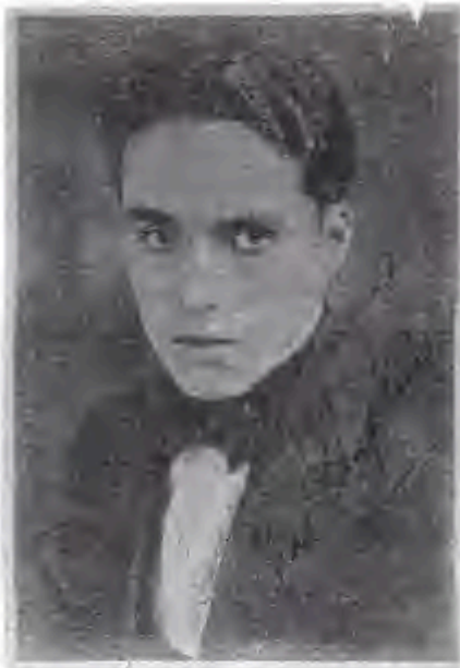
Beautiful Signed Charlie Chaplin Photograph as a Young Man