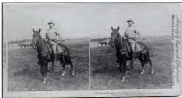
Theodore Roosevelt Steroview