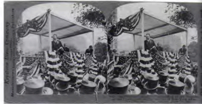
Theodore Roosevelt Steroview