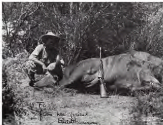
(see photo on back cover)

32. COOPER, GARY (1901-1960) Handsome American actor. Signed photo, 8vo b/w A young Cooper standing in formal attire. Boldly signed. " Sincerely, Gary Cooper " Pristine. $345